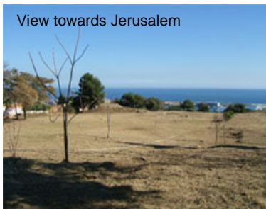
View towards Jerusalem

In the Jewish tradition, respect for the dead includes an absolute prohibition against exhumation, even centuries after burial. This explains the concern that arose in the local and international Jewish world when opening up of graves in the cemetery at Montjuïc was known. As a result of initiation of the proceedings of the BCIN declaration (Cultural Site of National Interest), information was also requested about the fate of the excavated remains in order to re-inter them.