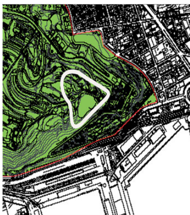
Location of ‘historic place’

When in 2006 the local press informed of the plan for some work which the City of Barcelona intended to carry out on Montjuïc, as a matter of course we were interested in those aspects of the project which might affect the old cemetery area. Specifically, in what is today a very special terrace, with views of the Mediterranean, which is to say facing toward Eretz Israel, they propose making a garden on one side, and a building on the other to provide restrooms and refreshments for the area.